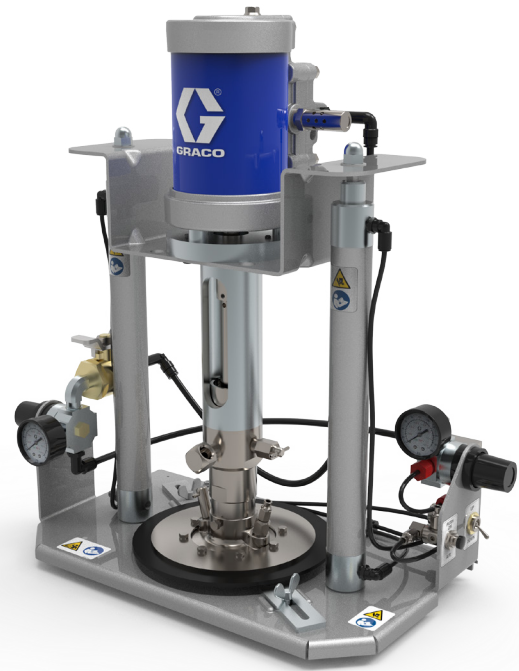
DynaMite 190 Supply Pump