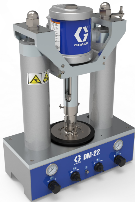
DynaMite 22 Supply Pump