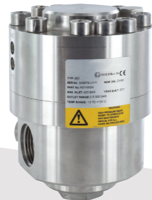
Dome loaded regulator